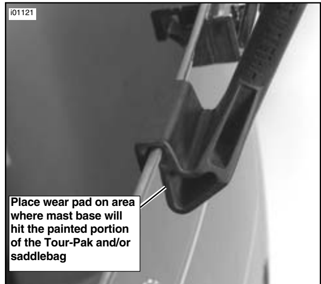
Figure 1. Flag mast installed on Tour-Pak