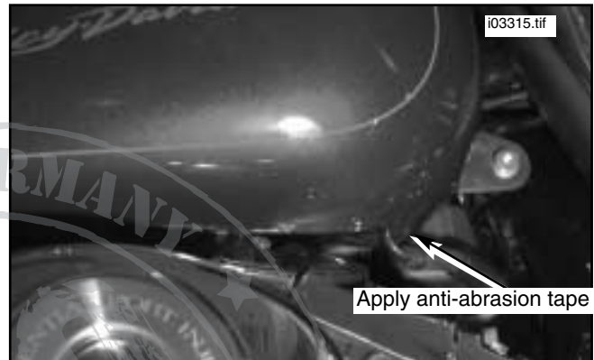
Figure 1. Installing Tank Bra