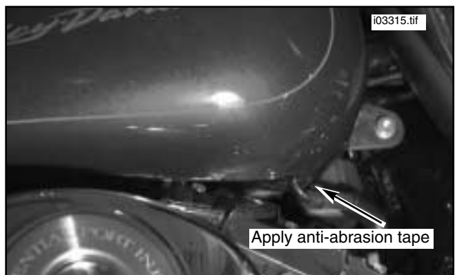
Figure 1. Installing Tank Bra