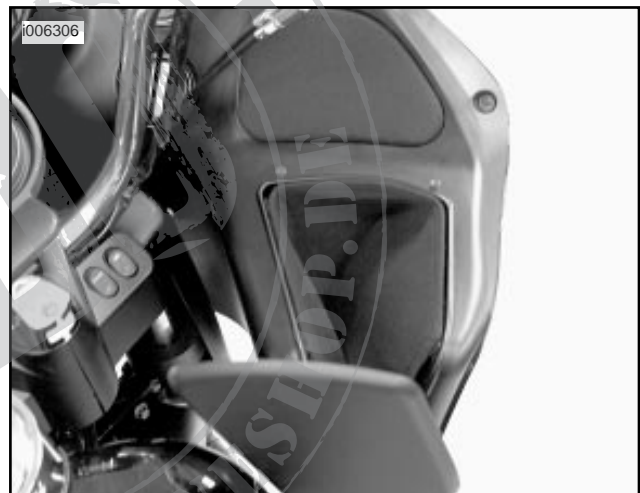
Figure 2. Installing Liner in Compartment