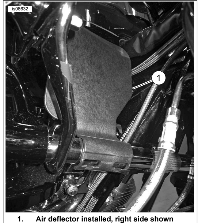
1. Air deflector installed, right side shown