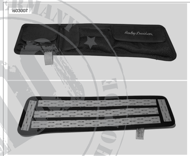
Figure 5. FLHRS Saddlebag Lid Organizer (Front and Back)