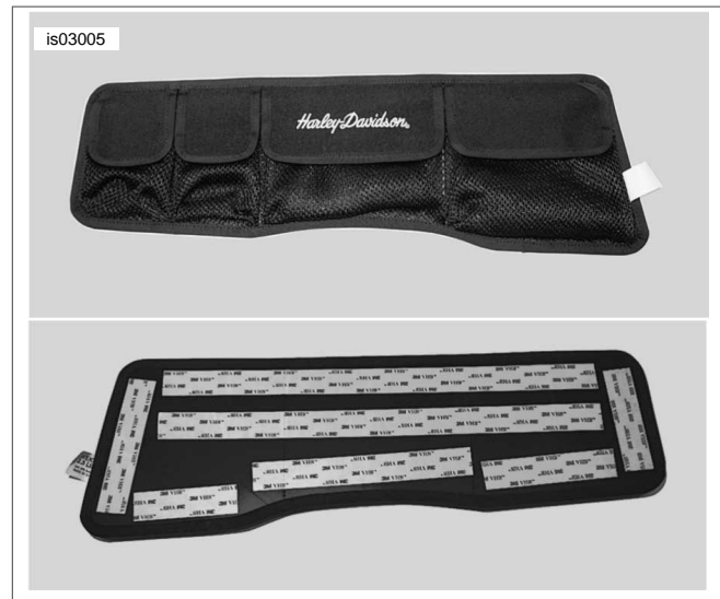
Figure 4. FLHRC Saddlebag Lid Organizer (Front and Back)