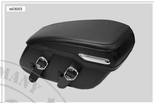
Figure 1. FLHRC Leather Saddlebag (right side shown)

The ideal temperature range for applying the tape is 70-100° F (21-38° C). Minimum application temperature is 50° F (10° C). If you attempt to apply the tape below these temperatures, the adhesive will become too firm to adhere readily.