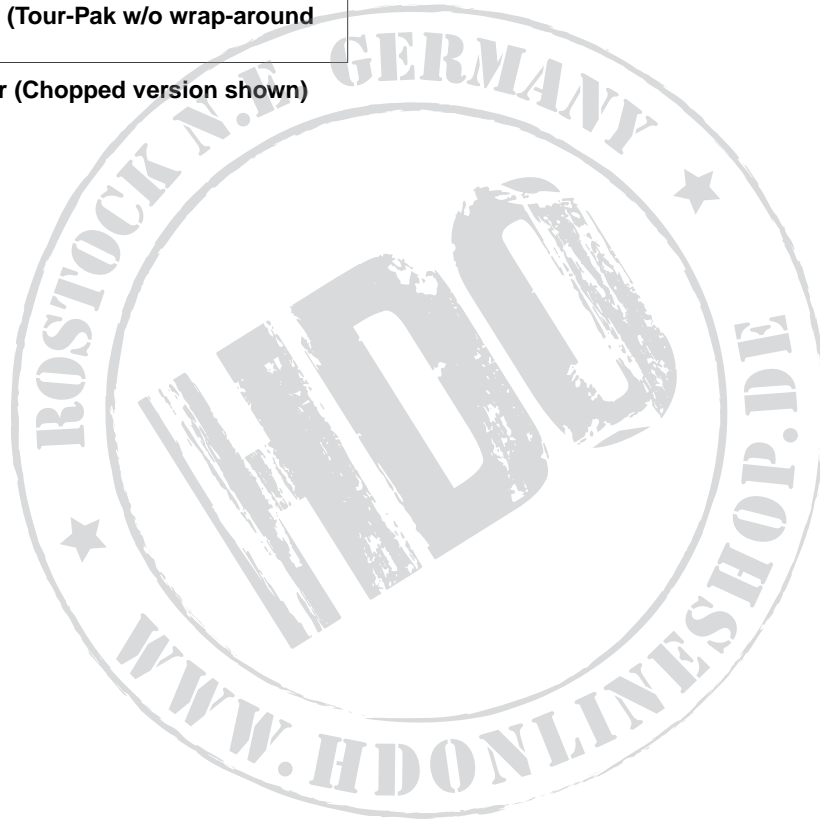
Figure 1. Tour-Pak Liner (Chopped version shown)