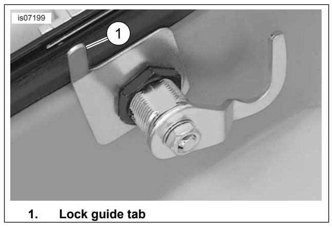
Figure 2. Lock Guide