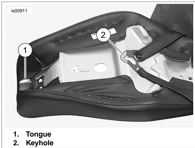
Figure 2. Underside of 2-up seat