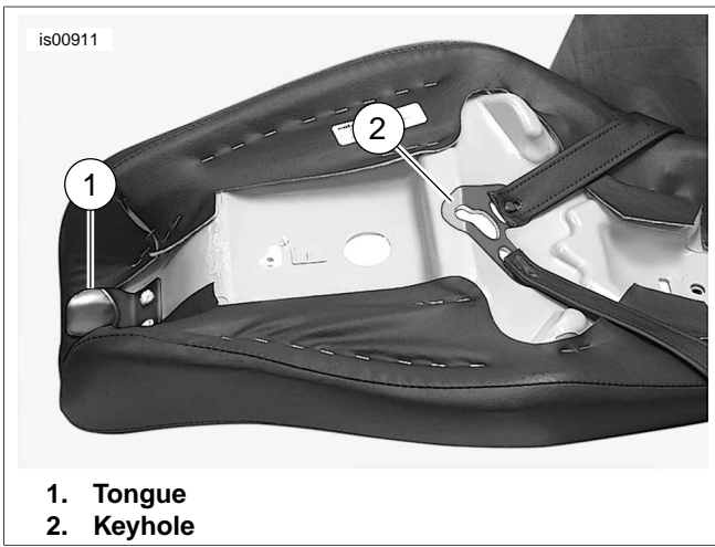
Figure 2. Underside of 2-up seat