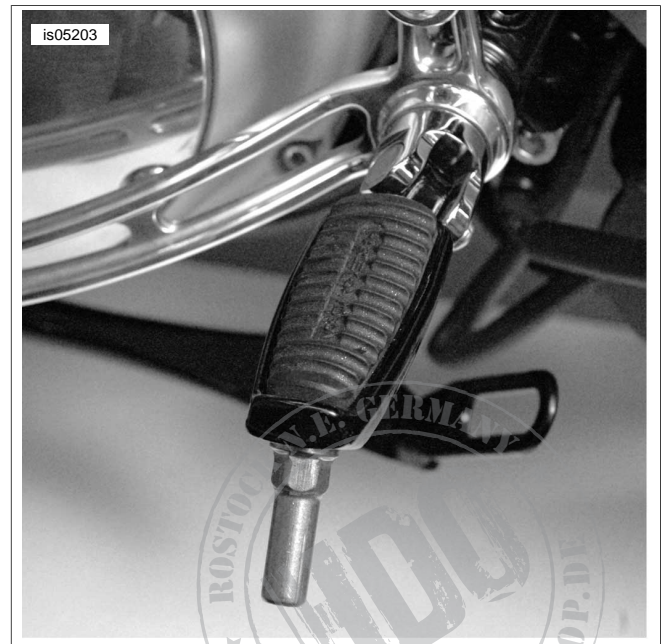
Figure 2. Correct installation (generic footpeg and wear tip)