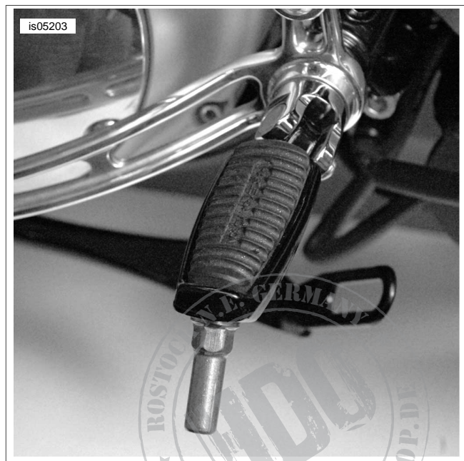
Figure 2. Correct installation (generic footpeg and wear tip)