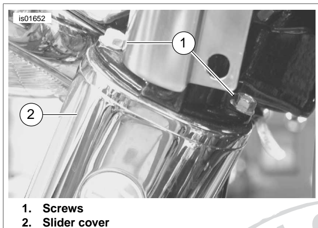
Figure 2. Install Decorative Slider Cover