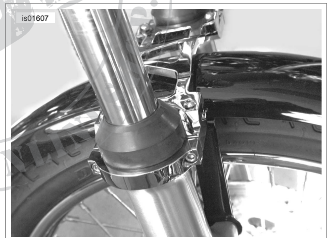
Figure 2. Installing Fork Brace Clamp Halves