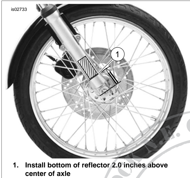
Figure 1. Reflector Placement

Ambient temperature should be at least 60° F (16° C) for proper adhesion of the reflectors to the sliders.