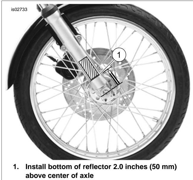
Figure 1. Reflector Placement