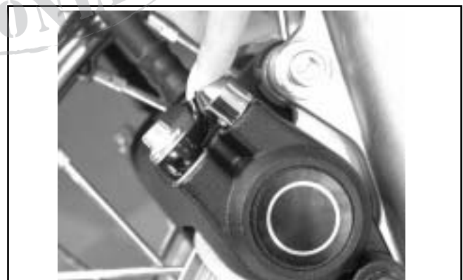
Figure 2. Hold down bleeder valve cover.