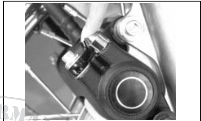
Figure 2. Hold down bleeder valve cover.