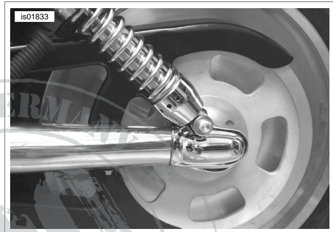
Figure 3. Left Axle Cover Installed