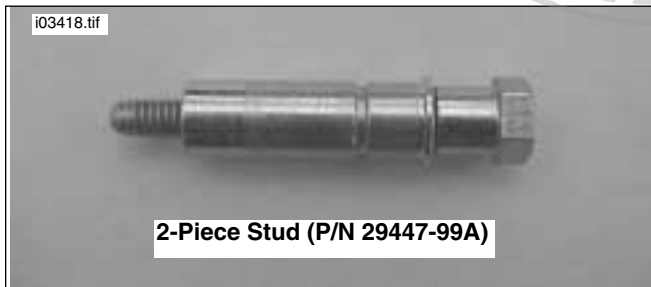
Figure 1. Replace mounting studs if necessary