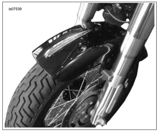
Figure 1. Front Fender Trim Placement - Small Fenders