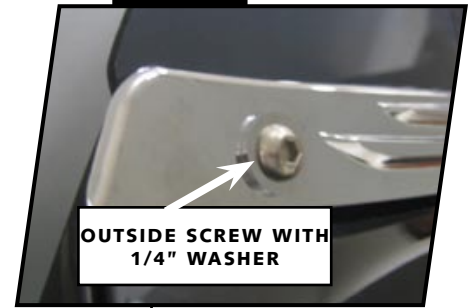
OUTSIDE SCREW WITH 1/4" WASHER